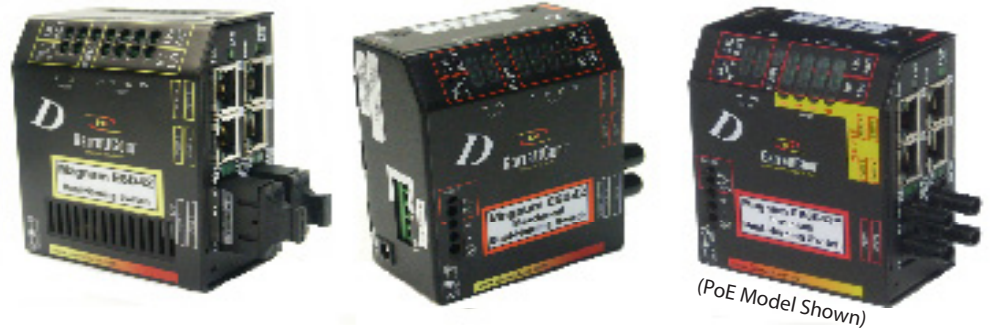
Office and Wiring Closet